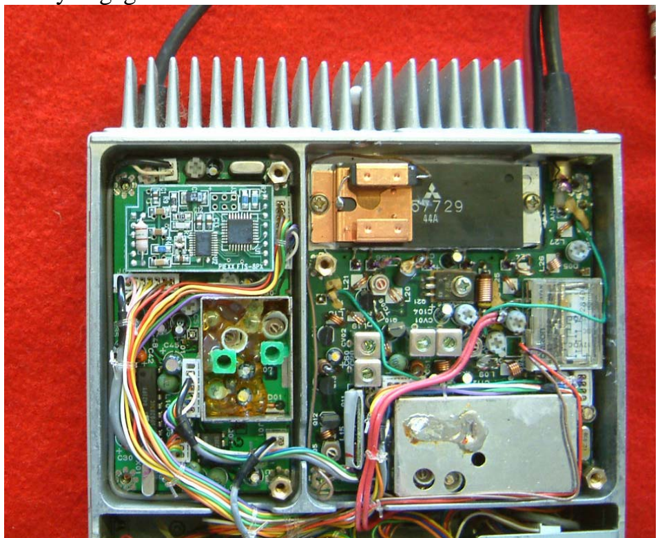
FTS-8px Installed in the FT-2700RH

5. Complete the installation by reinstalling the FT-2700RHs shield plate and top cover.