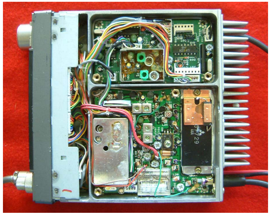
FT-2700RH Transceiver with the Dummy Board Removed.

4. Carefully align the connector pins on the FTS-8px with the two mating connectors on the transceiver. Press the FTS-8px down until the connector